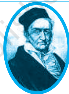
Carl Friedrich Gauss (1777 – 1855)

Carl Friedrich Gauss is often referred to as the 'Prince of Mathematicians' and is considered one of the three greatest mathematicians of all time, along with Archimedes and Newton. He has made fundamental contributions to both mathematics and science.